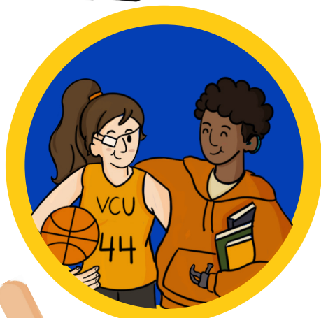
Sports & Book Clubs

This list can help you decide if a group is a good place for you.