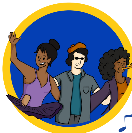
Band, Acting & Dance Classes